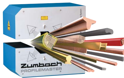
Profile measuring system